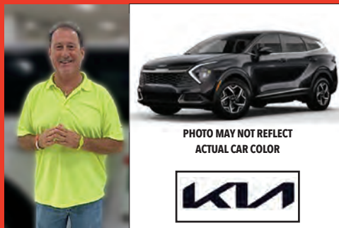
PHOTO MAY NOT REFLECT ACTUAL CAR COLOR